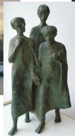
On the way to Emmaus